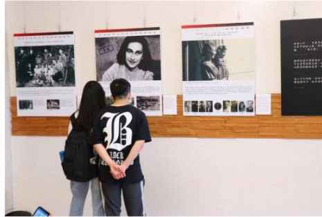
Shoah: How Was It Humanly Possible? Exhibition | Expected: April 19th - 30th

Teachers will also have access to holocaust texts from Newmarket.- historical photos of Kensington market: